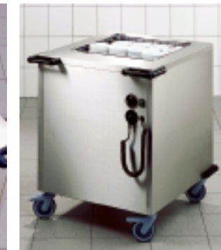
KOUH.50.50 Mobile Heated Basket Dispenser