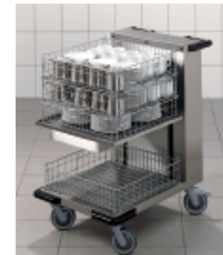
OKO.50.50 Open Basket Dispenser for up to 10 Baskets