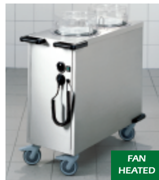
TEUH.2VS.2426 Mobile Fan Assisted, Heated Plate Dispenser Two Column