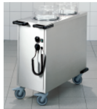
TEH.2V.1926 Mobile Heated Plate Dispenser