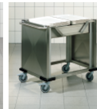
TA.253.37 Open Mobile Tray Dispenser Double Stack