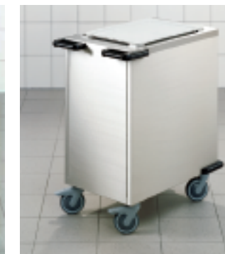
TAG.153.37 Mobile Tray Dispenser Fully Enclosed - Single Stack