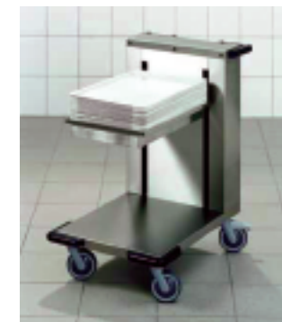
OTA.53.37 Open Mobile Tray Dispenser Single Stack