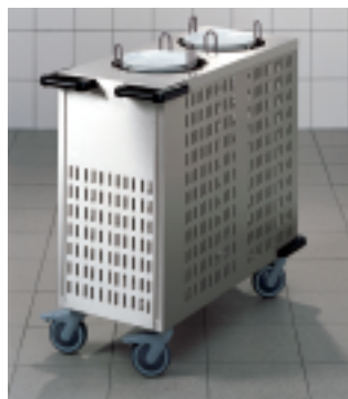
TE.2VK Mobile Unheated Plate Dispenser Vented for Cook Chill

The dispensers are available in open or closed designs for a variety of applications.