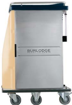
Optional 6 wheel configuration