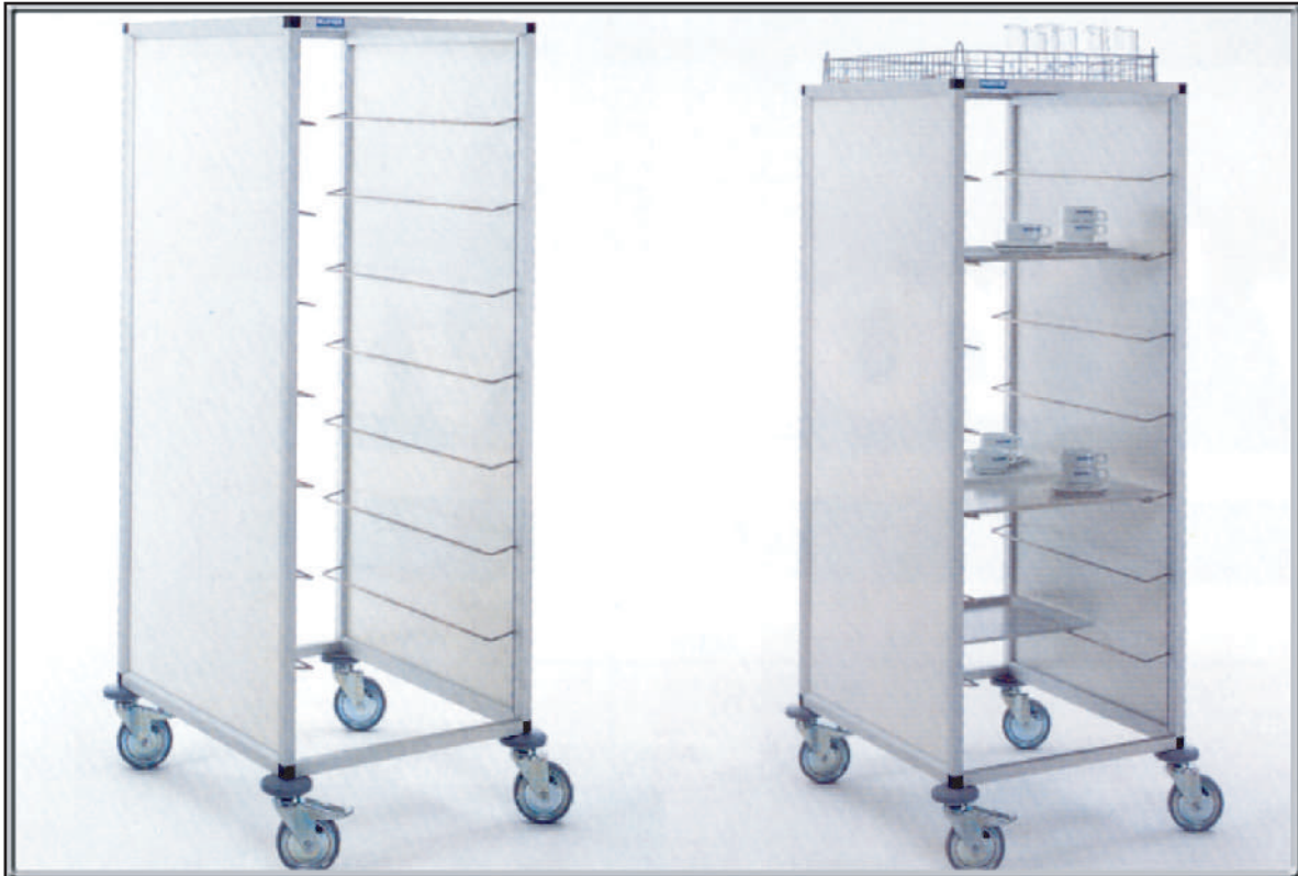
Tray carts, single compartment, with 2 x 7 support rails for cafeteria trays.

These attractive aluminium carts are designed especially for dishware returns and food service. The new Busing Cart Equipment range meets the highest demands of volume catering, cafererias, restaurants and similar foodservice operations. The main design criteria were load bearing capacity, manoeuvrability and ease of cleaning.