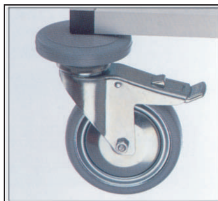
Swivel wheel with lock

Easy handling is guaranteed by four large swivel wheels, 5" dia (125 mm), with insulation gap.