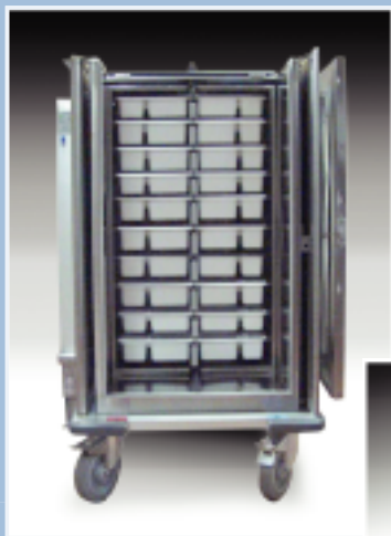
Loaded Rack inside Transport Cart