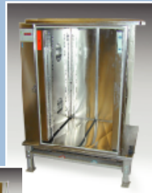
Alphagen Docking Station